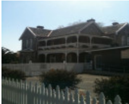
St Thomas vicarage.jpeg