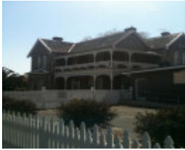
St Thomas vicarage.jpeg