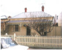
City of Darebin Heritage Review 2000