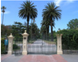
ST KILDA BOTANICAL GARDENS SOHE 2008