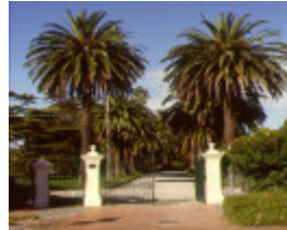
1 st kilda botanic gardens entrance jh may 1998