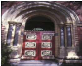
primary school number 2606 rathdowne street carlton entrance feb1985