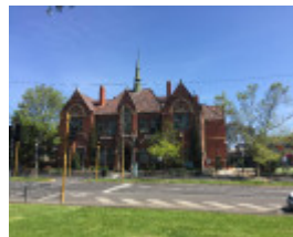
PRIMARY SCHOOL NO. 2605 October 2016