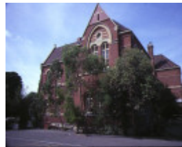
primary school number 2605 rathdowne street carlton side view feb1985