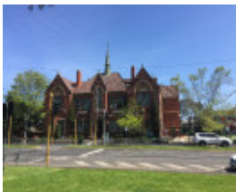
PRIMARY SCHOOL NO. 2605 October 2016