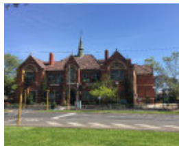
PRIMARY SCHOOL NO. 2605 October 2016