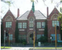
PRIMARY SCHOOL NO. 2605 SOHE 2008