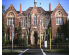
1 primary school number 2605 rathdowne street carlton front elevation 1992