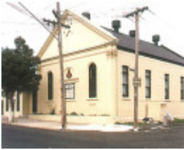
City of Darebin Heritage Review 2000