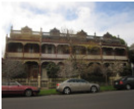
2-8 Bayview Terrace.JPG