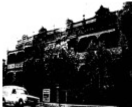
Essendon Conservation Study 1985