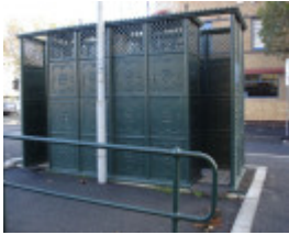
Urinal Nth Melbourne exterior KJ 21 07 2007