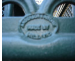
Urinal La Trobe Street plate 'Made by Anderson & Mitchell Melbourne' KJ 21 06 2007