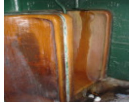
Urinal La Trobe Street terracotta stall KJ 21 06 2007