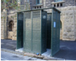
Urinal La Trobe Street exterior KJ 21 06 2007