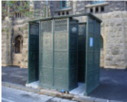
Urinal La Trobe Street exterior KJ 21 06 2007