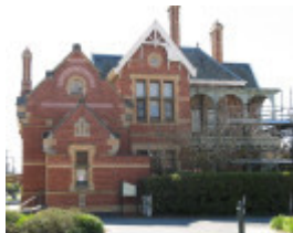
National bank_Euroa_exterior_KJ_Sept 08