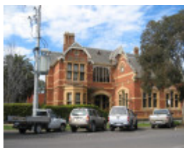
national bank_Euroa_view from Railway St_KJ_Sept 08