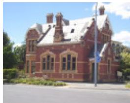
602190 national australia bank euroa1 pm1 feb04