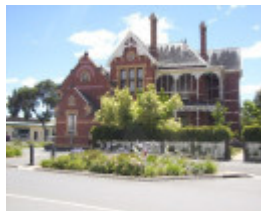
602190 national australia bank euroa2 pm1 feb04