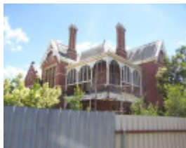
602190 national australia bank euroa6 pm1 feb04