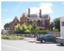
602190 national australia bank euroa3 pm1 feb04