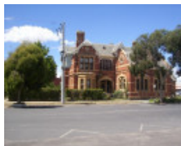
602190 national australia bank euroa5 pm1 feb04