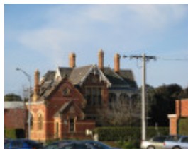
2441 Euroa old National Aust Bank