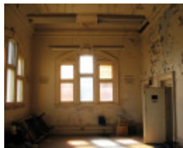
National Bank_Euroa_bank interior_KJ_Sept 08