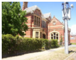
602190 national australia bank euroa4 pm1 feb04