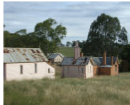
WARROCK SOHE 2008