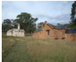
WARROCK SOHE 2008