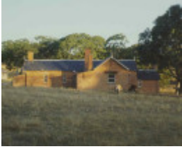
warrock warrock road casterton mens dining room publication