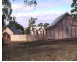
warrock warrock road casterton stables publication