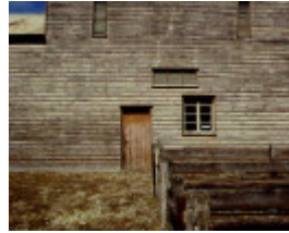
warrock warrock road casterton exterior detail of wool shed publication