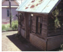
warrock 1843 casterton first cottage