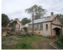
WARROCK SOHE 2008