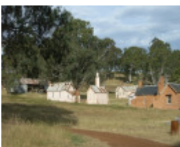
WARROCK SOHE 2008