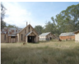
WARROCK SOHE 2008