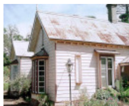
warrock warrock road casterton homestead publication