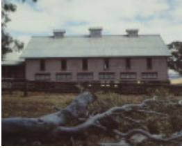
warrock warrock road casterton wool shed side view publication