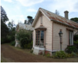
WARROCK SOHE 2008