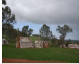
2018, View to the south west.jpg