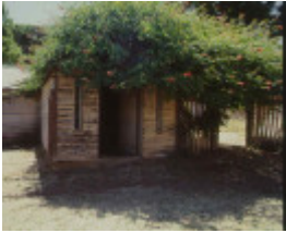
warrock warrock road casterton bacon house publication