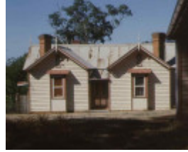
warrock warrock road casterton office publication