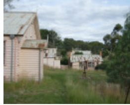
WARROCK SOHE 2008