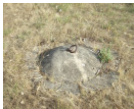
WARROCK SOHE 2008