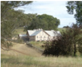
WARROCK SOHE 2008