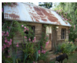
WARROCK SOHE 2008