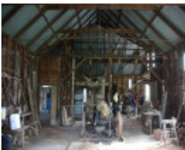
2018, Interior, Workshop.jpg