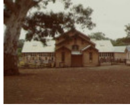
warrock warrock road casterton wool shed front view publication