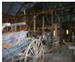
WARROCK SOHE 2008