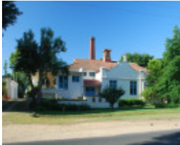
FORMER COWWARR BUTTER FACTORY SOHE 2008