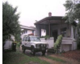
1 former cowwarr butter factory main road cowwarr north east side