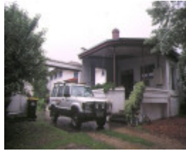
1 former cowwarr butter factory main road cowwarr north east side