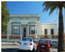
MEDICAL ROOMS SOHE 2008