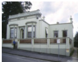
1 medical rooms mostyn street castlemaine front view