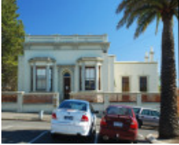
MEDICAL ROOMS SOHE 2008