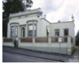
1 medical rooms mostyn street castlemaine front view