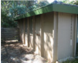
GUMNUTS SOHE 2008