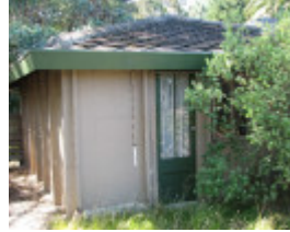
GUMNUTS SOHE 2008