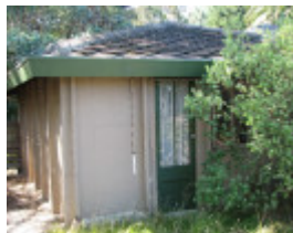
GUMNUTS SOHE 2008