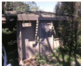
1 gumnuts frankston entrance