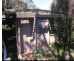
1 gumnuts frankston entrance