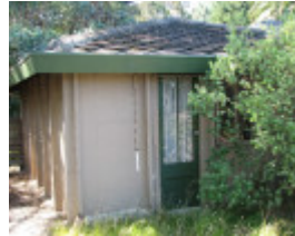
GUMNUTS SOHE 2008