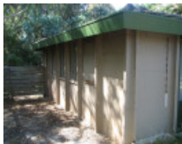
GUMNUTS SOHE 2008