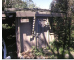
1 gumnuts frankston entrance