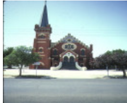
1 st andrews echuca front view feb1983