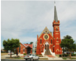
ST ANDREWS UNITING CHURCH SOHE 2008