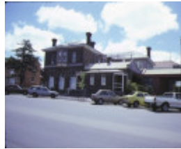
ararat post office street view nov1985