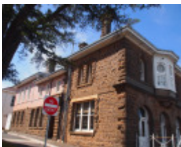
H0618 FORMER ARARAT SUB-TREASURY AND POST OFFICE LHA 2015 2.JPG