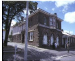
1 ararat post office front view nov1985