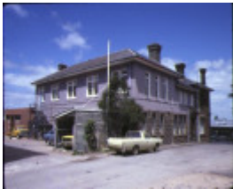
ararat post office street view3 nov1985