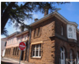
H0618 FORMER ARARAT SUB-TREASURY AND POST OFFICE LHA 2015 2.JPG