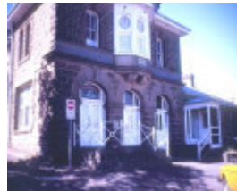
h00618 former ararat post office barkly street ararat front she project 2004