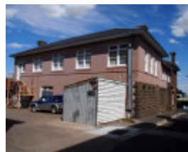
H0618 FORMER ARARAT SUB-TREASURY AND POST OFFICE LHA 2015 3.JPG