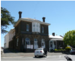
FORMER ARARAT SUB-TREASURY AND POST OFFICE SOHE 2008