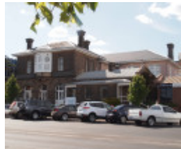
H0618 FORMER ARARAT SUB-TREASURY AND POST OFFICE LHA 2015 1.JPG