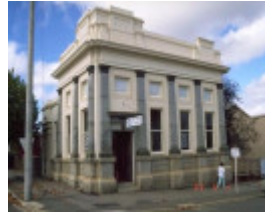
h00580 former state savings bank h0580