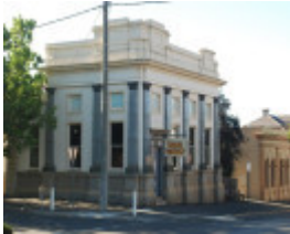
FORMER STATE SAVINGS BANK SOHE 2008