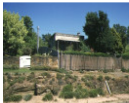
1 residence bowden street castlemaine front view