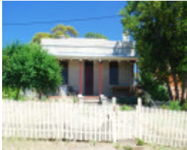
RESIDENCE SOHE 2008