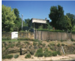
1 residence bowden street castlemaine front view