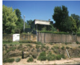
1 residence bowden street castlemaine front view