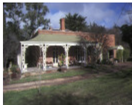
1 residence burnet road castlemaine front view jul1981