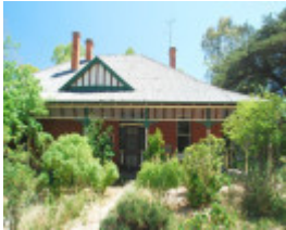
RESIDENCE SOHE 2008