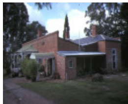
residence burnet road castlemaine rear view jul1981