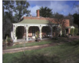
1 residence burnet road castlemaine front view jul1981