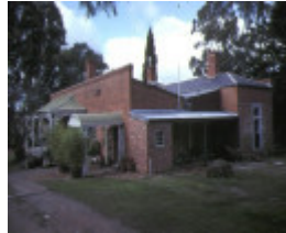
residence burnet road castlemaine rear view jul1981