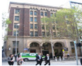
equity chambers - original unblurred image