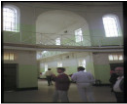
former hm prison challis street castlemaine centre of cell block