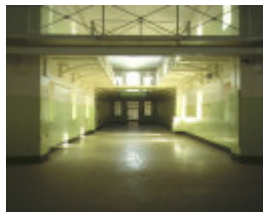
former hm prison challis street castlemaine interior corridor dec1992