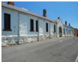
FORMER HM PRISON SOHE 2008