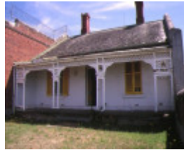
former hm prison challis street castlemaine govomers rsidence jan1996