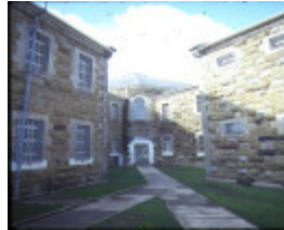
1 former hm prison challis street castlemaine cell block entrance aug1984