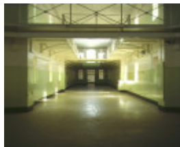
former hm prison challis street castlemaine interior corridor dec1992