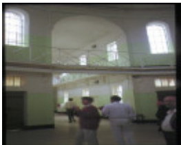
former hm prison challis street castlemaine centre of cell block