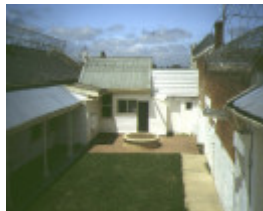
former hm prison challis street castlemaine forecourt & administration building dec1992