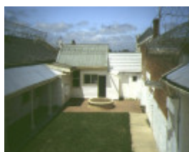
former hm prison challis street castlemaine forecourt & administration building dec1992