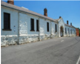
FORMER HM PRISON SOHE 2008