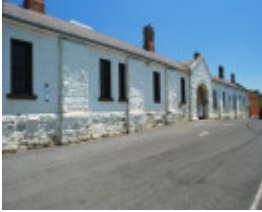
FORMER HM PRISON SOHE 2008