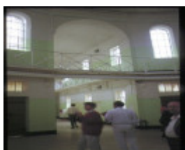
former hm prison challis street castlemaine centre of cell block