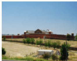
FORMER HM PRISON SOHE 2008