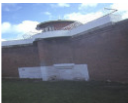
former hm prison challis street castlemaine watch tower & walls aug1984