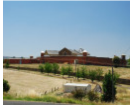
FORMER HM PRISON SOHE 2008