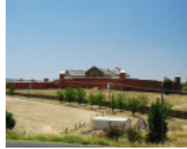
FORMER HM PRISON SOHE 2008