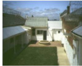
former hm prison challis street castlemaine forecourt & administration building dec1992