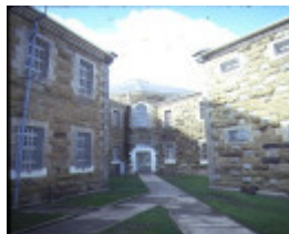
1 former hm prison challis street castlemaine cell block entrance aug1984