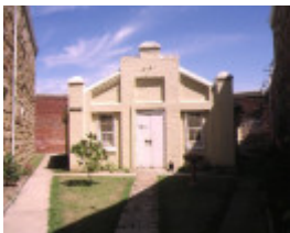
former hm prison challis street castlemaine industry building jan1996