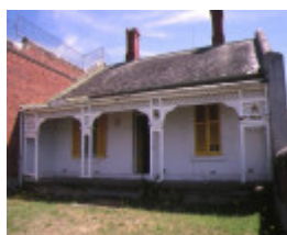
former hm prison challis street castlemaine governors residence jan1996