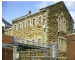
former hm prison challis street castlemaine rear view of cell block