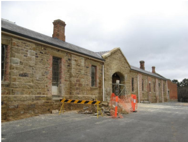
facade conservation as at 25May2011 005.jpg