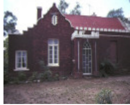
residence farnsworth street castlemaine side view may1984