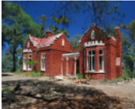
RESIDENCE SOHE 2008