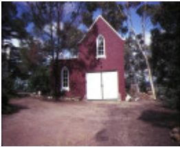
residence farnsworth street castlemaine outbuilding may1984