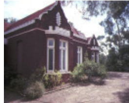
1 residence farnsworth street castlemaine front view may1984