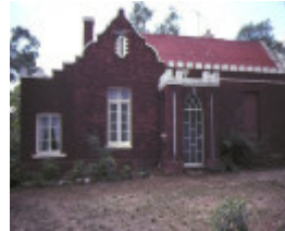
residence farnsworth street castlemaine side view may1984