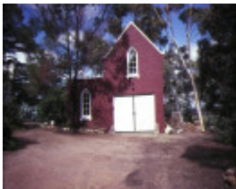
residence farnsworth street castlemaine outbuilding may1984