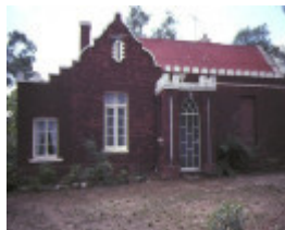
residence farnsworth street castlemaine side view may1984