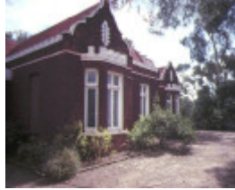
1 residence farnsworth street castlemaine front view may1984