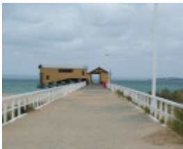
QUEENSLIFF PIER AND LIFEBOAT COMPLEX SOHE 2008