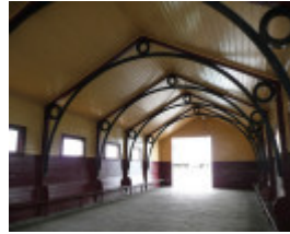
QUEENSLIFF PIER AND LIFEBOAT COMPLEX SOHE 2008