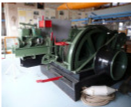
QUEENSLIFF PIER AND LIFEBOAT COMPLEX SOHE 2008