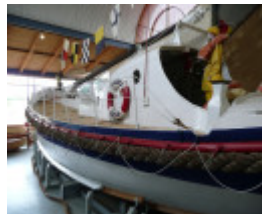
QUEENSLIFF PIER AND LIFEBOAT COMPLEX SOHE 2008