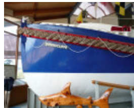
QUEENSLIFF PIER AND LIFEBOAT COMPLEX SOHE 2008