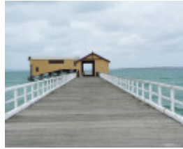
QUEENSLIFF PIER AND LIFEBOAT COMPLEX SOHE 2008