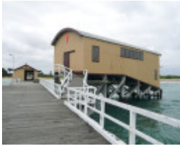
QUEENSLIFF PIER AND LIFEBOAT COMPLEX SOHE 2008