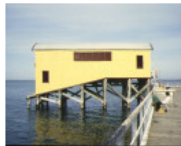
1 south pier waiting room & lifeboat shed queenscliff lifeboat shelter side view