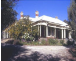
h00721 1 kaweka hargreaves street castlemaine house from drive she project 2003