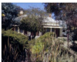
h00721 kaweka hargreaves street castlemaine house from pond she project 2003