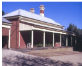
h00721 kaweka hargreaves street castlemaine east side she project 2003