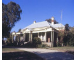
h00721 kaweka hargreaves street castlemaine front of home she project 2003