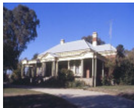
h00721 kaweka hargreaves street castlemaine front of home she project 2003