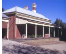
h00721 kaweka hargreaves street castlemaine east side she project 2003