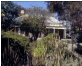
h00721 kaweka hargreaves street castlemaine house from pond she project 2003