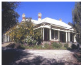
h00721 1 kaweka hargreaves street castlemaine house from drive she project 2003