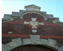
Anglo-Dutch gable and emblem incorporating 1891 MFB-designed corporate shield