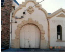
1990: at time of purchase by ABC, prior to removal of exterior paint