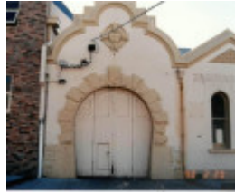
1990: at time of purchase by ABC, prior to removal of exterior paint