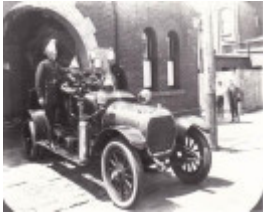
c.1918: Hotchkiss Fire Engine and crew at the horseshoe arch on Selwyn Street