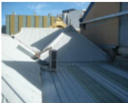
Looking towards the west (Selwyn Street) at the 1896 building's roofscape