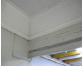
Steel lintel supporting a remnant of the 1896 building's east wall in the north-east corner of the former fire engine room