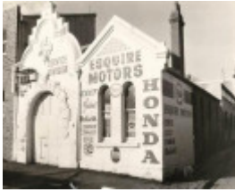
1974: re-purposed as the Esquire Motors garage