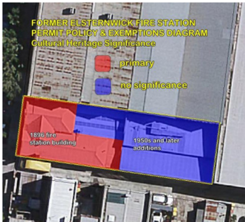
Former Elsternwick Fire Station PERMIT POLICY AND EXEMPTIONS DIAGRAM 10 August 2017