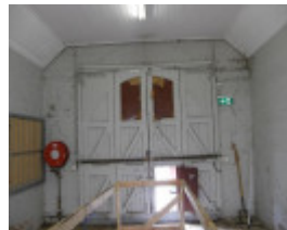
Looking west at the timber and glass doors to the former fire engine room