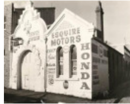
1974: re-purposed as the Esquire Motors garage