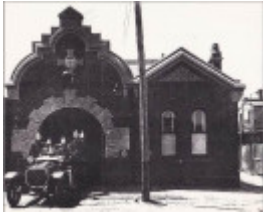
c.1918: Selwyn Street elevation with Hotchkiss Fire Engine and crew. The Station's original roof materials are visible