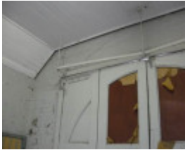
Timber-boarded ceiling junction with south and west walls inside the former fire engine room