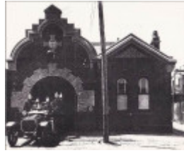
c.1918: Selwyn Street elevation with Hotchkiss Fire Engine and crew. The Station's original roof materials are visible