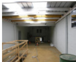
Looking west towards the fire engine room from the space formed by the mid-1950s roofing of the former yard