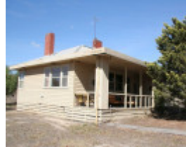
H2167 Lady Northcote Camp House 12