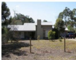
H2167 Lady Northcote Camp Manager s Residence