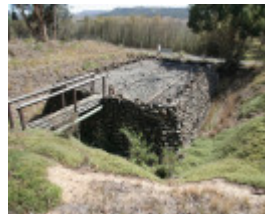
H2167 Lady Northcote Camp Sewerage System