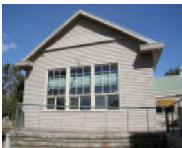
H2167 Lady Northcote Camp Dining Hall