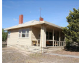
H2167 Lady Northcote Camp House 12