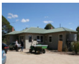
Lady Northcote Camp Hospital