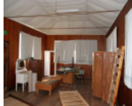
H2167 Lady Northcote Camp House 12 dormitory