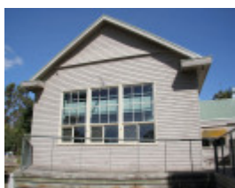
H2167 Lady Northcote Camp Dining Hall