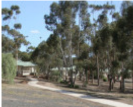
H2167 Lady Northcote Camp