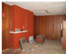
H2167 Lady Northcote Camp House 12 front room