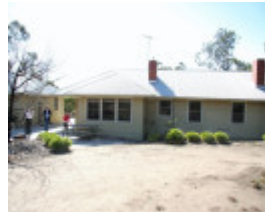
H2167 Lady Northcote Camp Angliss House