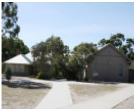
H2167 Lady Northcote Camp Dining Hall Kitchen