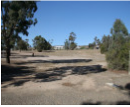
H2167 Lady Northcote Camp 1