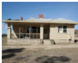
H2167 Lady Northcote Camp House 11