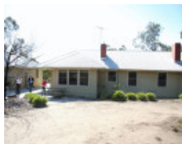
H2167 Lady Northcote Camp Angliss House