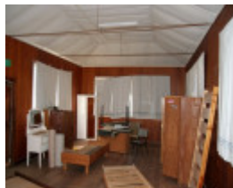
H2167 Lady Northcote Camp House 12 dormitory