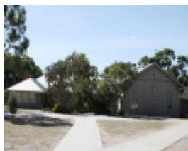
H2167 Lady Northcote Camp Dining Hall Kitchen