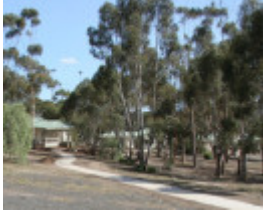
H2167 Lady Northcote Camp