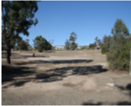
H2167 Lady Northcote Camp 1