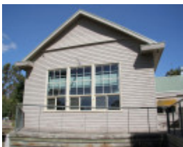
H2167 Lady Northcote Camp Dining Hall