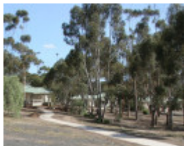
H2167 Lady Northcote Camp