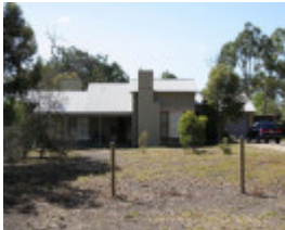
H2167 Lady Northcote Camp Manager's Residence