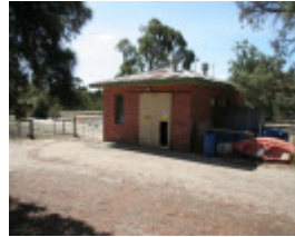
H2167 Lady Northcote Camp Maintenance Shed