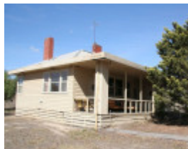
H2167 Lady Northcote Camp House 12