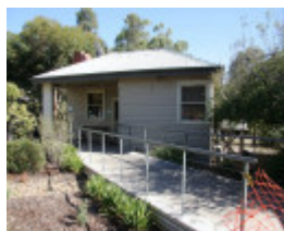
H2167 Lady Northcote Camp Office former Cook s Cottage