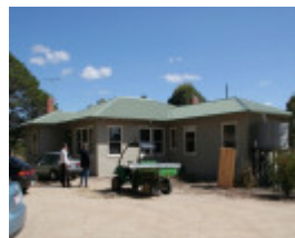
Lady Northcote Camp Hospital