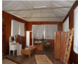
H2167 Lady Northcote Camp House 12 dormitory