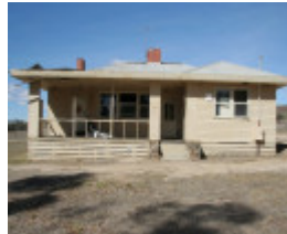
H2167 Lady Northcote Camp House 11