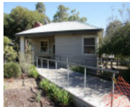
H2167 Lady Northcote Camp Office former Cook s Cottage