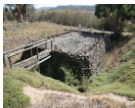
H2167 Lady Northcote Camp Sewerage System