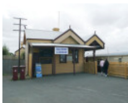
QUEENSCLIFF RAILWAY STATION SOHE 2008