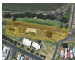
queenscliff railway station extent overlaid on air photo.JPG