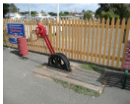
QUEENSCLIFF RAILWAY STATION SOHE 2008