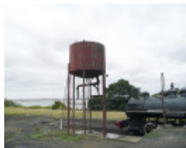
QUEENSCLIFF RAILWAY STATION SOHE 2008