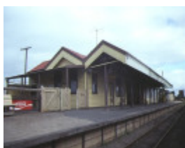
1 queenscliff railway station wharf street queenscliff front view aug1984