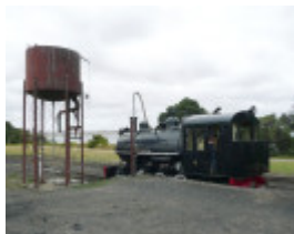
QUEENSCLIFF RAILWAY STATION SOHE 2008