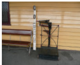
QUEENSCLIFF RAILWAY STATION SOHE 2008