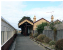
QUEENSCLIFF RAILWAY STATION SOHE 2008