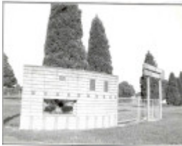
26949 Barwon Heads Road South Barwon Reserve Memorial Photo