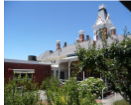
PYRENEES HOUSE SOHE 2008