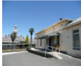
PYRENEES HOUSE SOHE 2008