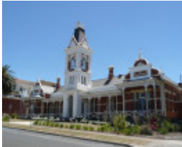
PYRENEES HOUSE SOHE 2008