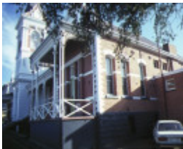
pyrenees house ararat from east jun1984