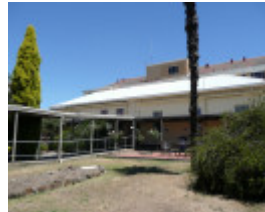
PYRENEES HOUSE SOHE 2008