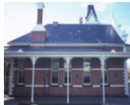
pyrenees house ararat from west jun1984