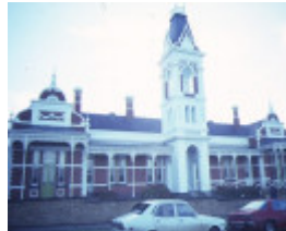
1 pyrenees house ararat front view jun1984