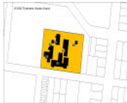
Pyrenees House Plan