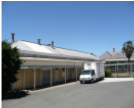
PYRENEES HOUSE SOHE 2008