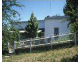
1 residence mostyn street castlemaine front view