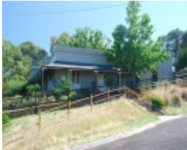
RESIDENCE SOHE 2008