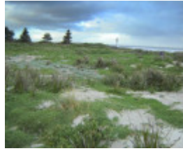
H1659 griffith island port fairy landscape3