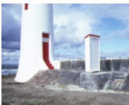
griffith island lighthouse griffith island port fairy entrance