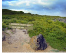
H1659 griffith island port fairy shearwater colony