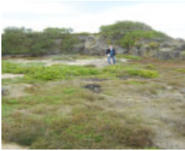
H1659 griffith island port fairy quarry2