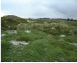
H1659 griffith island port fairy landscape