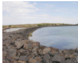
GRIFFITHS ISLAND SOHE 2008