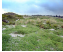
H1659 griffith island port fairy landscape2