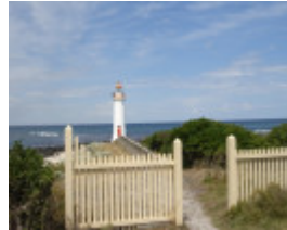
GRIFFITHS ISLAND SOHE 2008