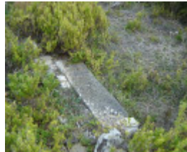
H1659 griffith island port fairy keepers quarters remains2