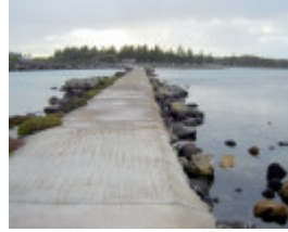
H1659 griffith island port fairy causeway