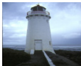
griffith island lighthouse griffith island port fairy rear view