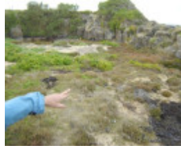
H1659 griffith island port fairy quarry1