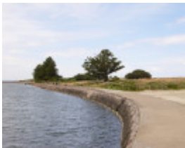
GRIFFITHS ISLAND SOHE 2008