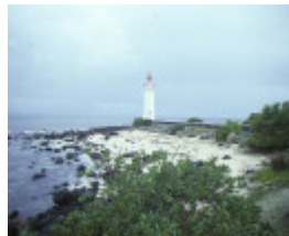
griffith island lighthouse griffith island port fairy landscape