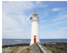
GRIFFITHS ISLAND SOHE 2008