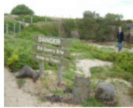
H1659 griffith island port fairy quarry3