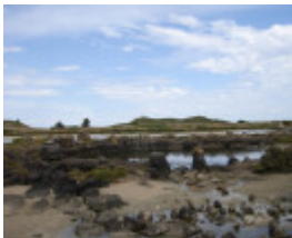
GRIFFITHS ISLAND SOHE 2008