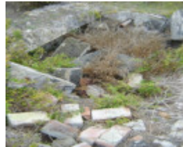
H1659 griffith island port fairy keepers quarters remains