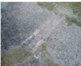
H1659 griffith island port fairy keepers quarters garden remains