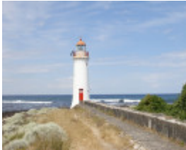
GRIFFITHS ISLAND SOHE 2008