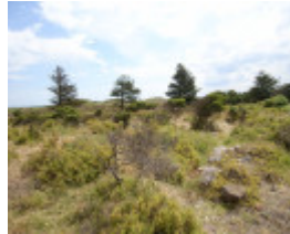
GRIFFITHS ISLAND SOHE 2008