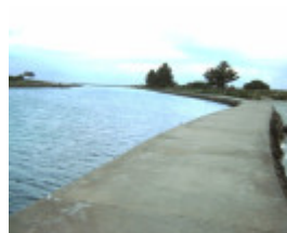
H1659 griffith island port fairy training wall