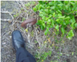
H1659 griffith island port fairy lighthouse mast footings