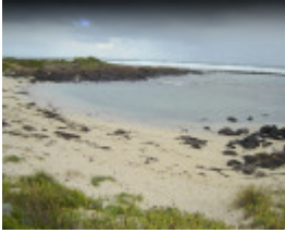
H1659 griffith island port fairy beach1