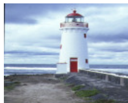
1 griffith island lighthouse griffith island port fairy front view