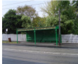
H0174 Tram shelter Balaclava Rd Front view Apr 2006