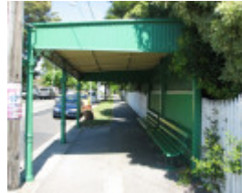
TRAM VERANDAH SHELTER SOHE 2008