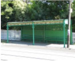
TRAM VERANDAH SHELTER SOHE 2008