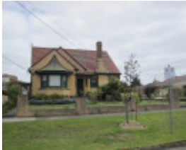
32 Vida Street.JPG