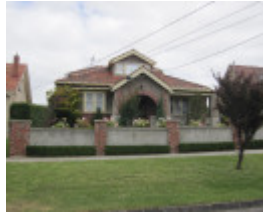
34 Vida Street.JPG