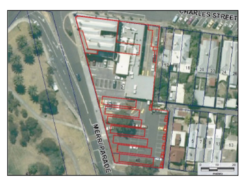
27270 Outline of 1905 hotel and residences