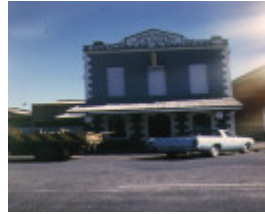
1 former shop & residence templeton street castlemaine front view