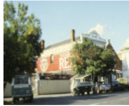
former shop & residence templeton street castlemaine side view