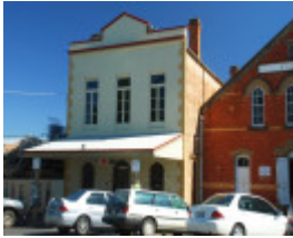
FORMER SHOP AND RESIDENCE SOHE 2008