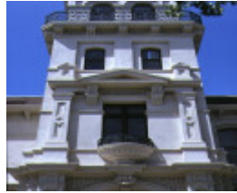
myoora alma rd caulfield detail tower front