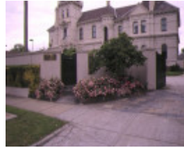
myoora alma rd caulfield front view