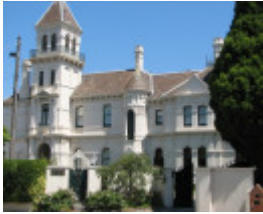
MYOORA SOHE 2008