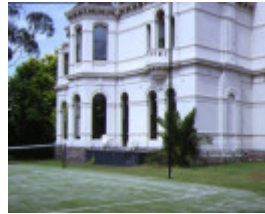
myoora alma road caulfield rear view