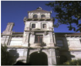
myoora alma road caulfield tower elevation