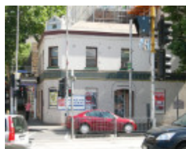
DUKE OF WELLINGTON HOTEL SOHE 2008