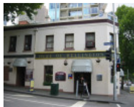
h01175 duke of wellington 1850 building 0104 mz