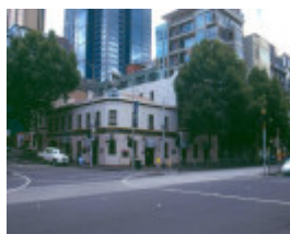
h01175 1 duke of wellington corner elevation 0104 mz