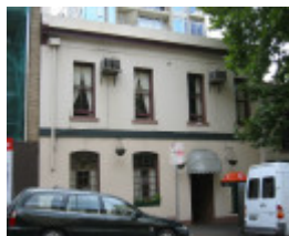
h01175 duke of wellington 1904 addition 0104 mz