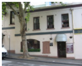
h01175 duke of wellington 1857 addition 0104 mz