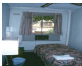
h01175 duke of wellington 1857 interior 0104 mz