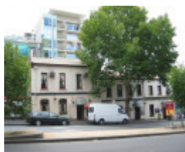
h01175 duke of wellington russell st elevation 0104 mz