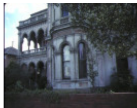
labassa caulfield front view