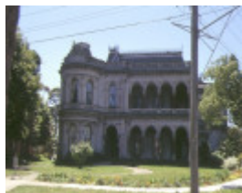
labassa manor grove north caulfield front view oct1999