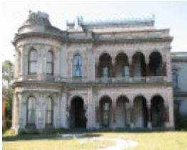
LABASSA SOHE 2008