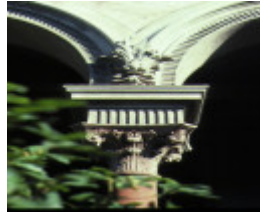
labassa caufield detail column capital