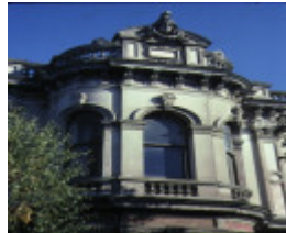
labassa caufield external windows