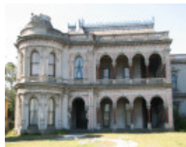
LABASSA SOHE 2008