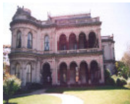
1 labassa caulfield front elevation oct1999