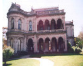
1 labassa caulfield front elevation oct1999