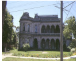
labassa manor grove north caulfield front view oct1999