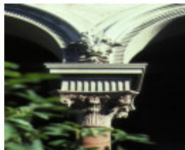
labassa caulfield detail column capital