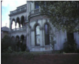
labassa caufield front view