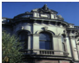
labassa caulfield external windows