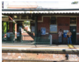
CAULFIELD RAILWAY STATION COMPLEX SOHE 2008