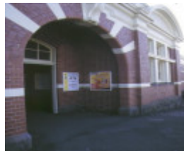
caulfield railway station normanby road caufield side detail jan1998