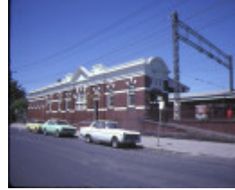
1 caulfield railway station normanby road caufield front view nov1984