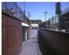
caulfield railway station normanby road caufield underpass nov1984