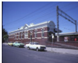
1 caulfield railway station normanby road caufield front view nov1984