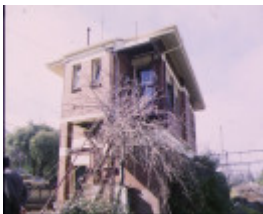
caulfield railway station normanby road caufield signal box aug1998