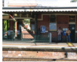
CAULFIELD RAILWAY STATION COMPLEX SOHE 2008