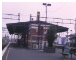
caulfield railway station normanby road caufield platform view aug1998