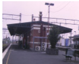
caulfield railway station normanby road caufield platform view aug1998