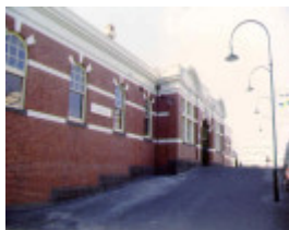
caulfield railway station normanby road caufield entry sw aug1998