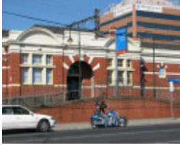
CAULFIELD RAILWAY STATION COMPLEX SOHE 2008