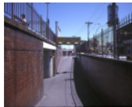
caulfield railway station normanby road caufield underpass nov1984