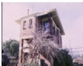
caulfield railway station normanby road caufield signal box aug1998