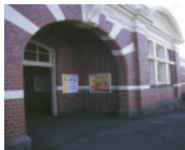
caulfield railway station normanby road caufield side detail jan1998