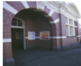
caulfield railway station normanby road caufield side detail jan1998