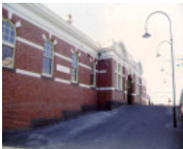
caulfield railway station normanby road caufield entry sw aug1998