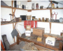
LIFEBOAT STATION SOHE 2008