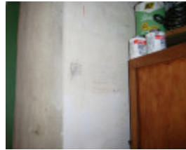
LIFEBOAT STATION SOHE 2008