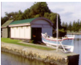
1 lifeboat station port fairy sw aug1999