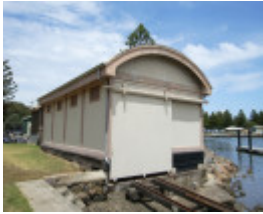
LIFEBOAT STATION SOHE 2008