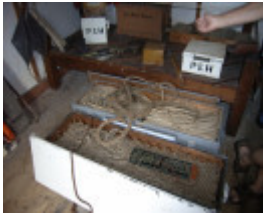
LIFEBOAT STATION SOHE 2008