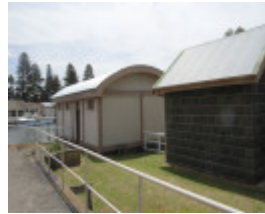
LIFEBOAT STATION SOHE 2008