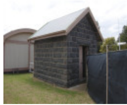
LIFEBOAT STATION SOHE 2008