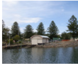
LIFEBOAT STATION SOHE 2008