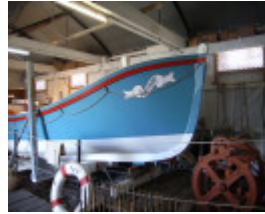
LIFEBOAT STATION SOHE 2008