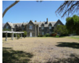
FORMER PROTESTANT ORPHAN ASYLUM AND COMMON SCHOOL SOHE 2008