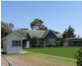
FORMER PROTESTANT ORPHAN ASYLUM AND COMMON SCHOOL SOHE 2008