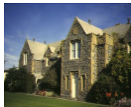
1 former protestant orphan asylum & common school herne hill front view of asylum