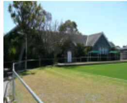
FORMER PROTESTANT ORPHAN ASYLUM AND COMMON SCHOOL SOHE 2008