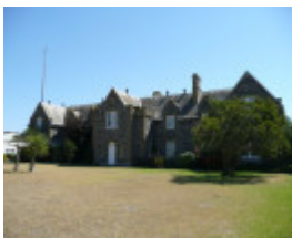
FORMER PROTESTANT ORPHAN ASYLUM AND COMMON SCHOOL SOHE 2008