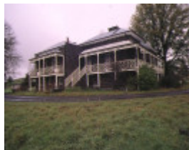
1 montpellier flour mill house calder hwy carlsruhe side view