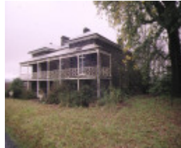
Montpellier Flour Mill House Calder Hwy Carlsruhe Front View