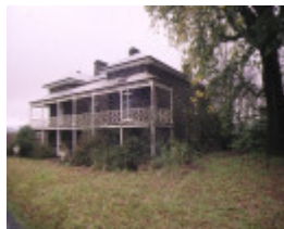
Montpellier Flour Mill House Calder Hwy Carlsruhe Front View