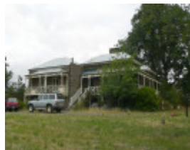
SKELSMERGH HALL SOHE 2008