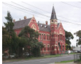
28247 Francis St Former Yarraville Primary School