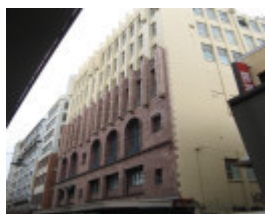
DJs former Coles_rear elevation_16 Jan 08