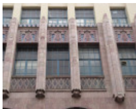
DJs former Coles_rear facade detail_16 Jan 08