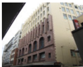
DJs former Coles_rear elevation_16 Jan 08