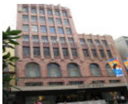
DJs former Coles_front facade_16 Jan 08