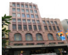
DJs former Coles_front facade_16 Jan 08