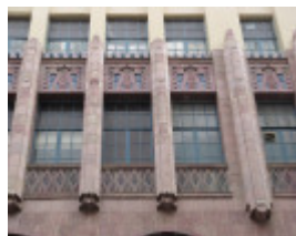
DJs former Coles_rear facade detail_16 Jan 08