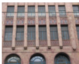
DJs former Coles_facade detail_16 Jan 08