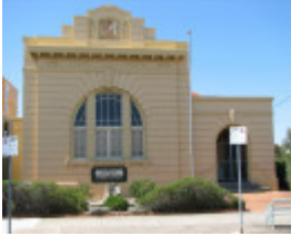
CHELSEA COURT HOUSE SOHE 2008