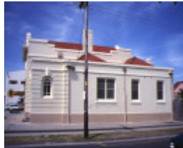
chelsea court house the strand chelsea side view