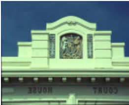
chelsea court house the strand chelsea detail of coat of arms