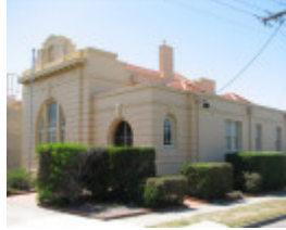
CHELSEA COURT HOUSE SOHE 2008