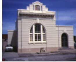
1 chelsea court house the strand chelsea front view