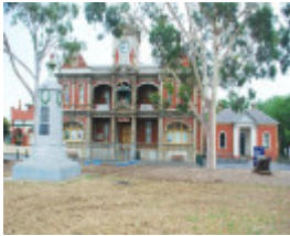
EAGLEHAWK TOWN HALL, MECHANICS INSTITUTE AND TWO HMVS NELSON CANNONS SOHE 2008