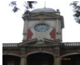
After Photographs - Reference F3844 13/07/15