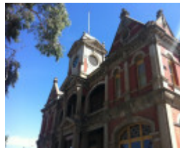
Before Photograph - Reference F3844 2014