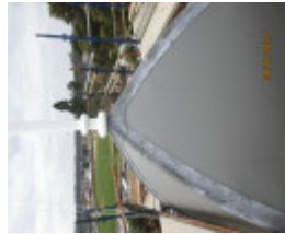
After Photographs - Reference F3844 08/07/15