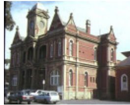
1 eaglehawk town hall mechanics institute & two hmvs nelson cannons eaglehawk side view