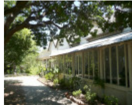
BARWON GRANGE SOHE 2008