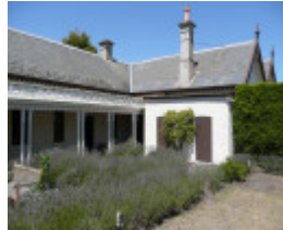
BARWON GRANGE SOHE 2008