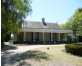
BARWON GRANGE SOHE 2008