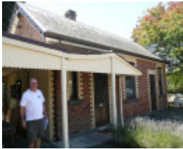
BARWON GRANGE SOHE 2008