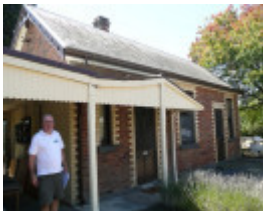
BARWON GRANGE SOHE 2008