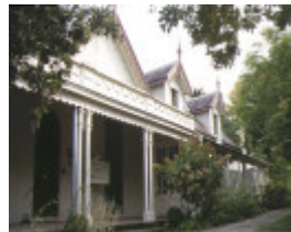
1 barwon grange fernleigh street newtown front view apr1997