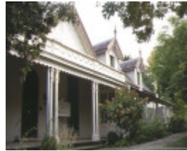
1 barwon grange fernleigh street newtown front view apr1997