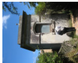
Mintaro detached toilet