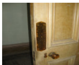
Mintaro door furniture