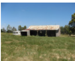
Mintaro former woolshed