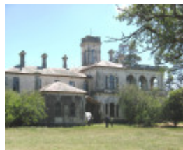
Mintaro from south