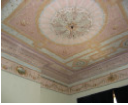
Mintaro drawing room