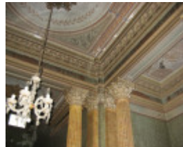
Mintaro entrance hall