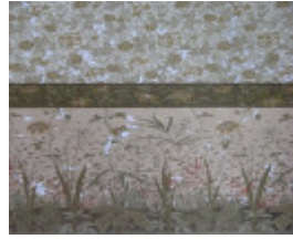
Mintaro wallpaper scheme