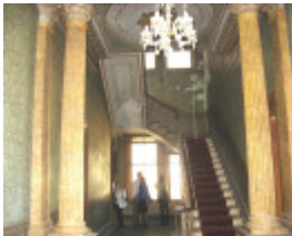
Mintaro stair hall