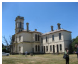
Mintaro from NW