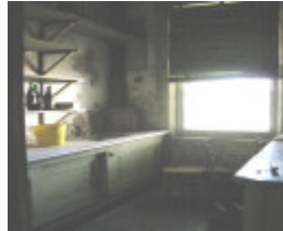
Mintaro butler's pantry