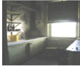
Mintaro butler's pantry