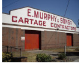
HO182 (2) - Murphy's Transport, 248 Whitehall Street, Yarraville.JPG