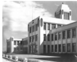
GMH Fishermans Bend - c 1938