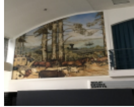
GMH Fishermans Bend mural 1a