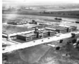
GMH Fishermans Bend - c 1938