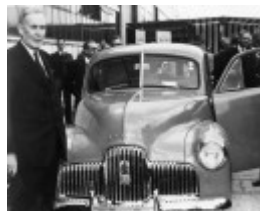
GMH Fishermans Bend - Prime Minister Ben Chifley at launch of Holden 48-215 at Fishermans Bend - 1948