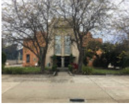
GMH - Social Centre - 2019