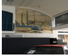
GMH Fishermans Bend - mural 2a