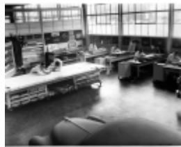
GMH Fishermans Bend - Plant 3 Interior - 1950