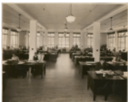
GMH Fishermans Bend - Administration Building Interior - c 1938