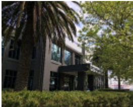
GMH Fishermans Bend - Parts Building - 2019