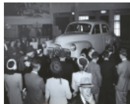
GMH Fishermans Bend - Social Centre during launch of Holden 48-215 - 1948