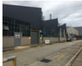
GMH Fishermans Bend - Plant 3 western elevation - 2019