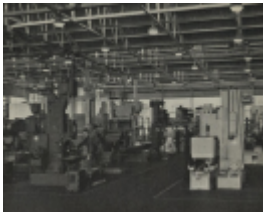
GMH Fishermans Bend - Plant 3 interior - 1945