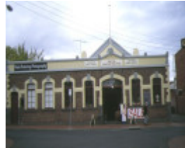
1 former duckers auction rooms geelong front view apr1997