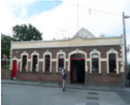
FORMER DUCKERS AUCTION ROOMS SOHE 2008